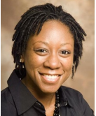
upport, American Academy of Religion Staff Liaison