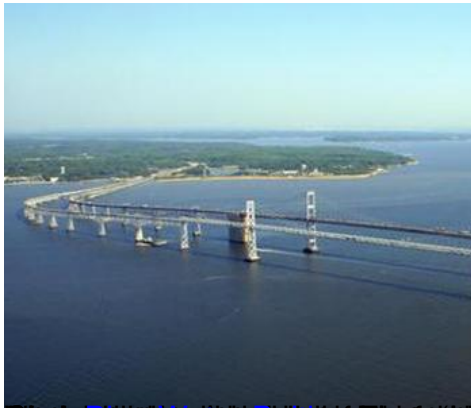
View from Baltimore